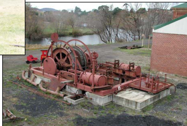
Hebburn steam winding plant, Goulburn, NSW. Originally from the Newcastle coalfields.