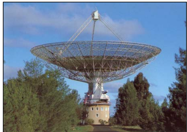
Radio telescope, Parkes, NSW, commissioned 1961

Moveable engineering heritage may include all items of tooling and equipment that can be readily transported from site to site. It could also extend to full sets of factory or mill equipment such as mine processing plant or dredges, which are relocated once the work is completed.