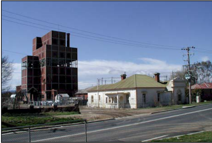
Gasworks, Bathurst, NSW, 1887 First municipally owned works in Australia