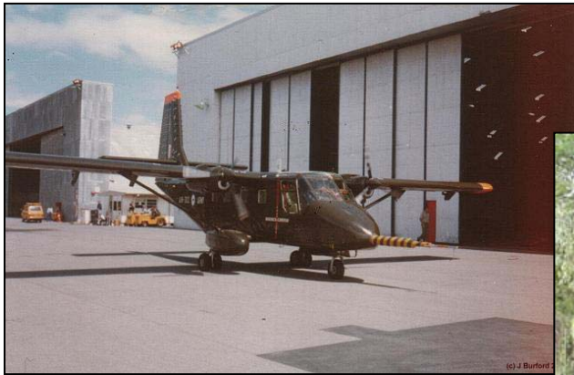
Australia's Nomad aircraft