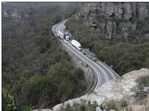
Victoria Pass built on Surveyor Mitchell's line of 1832; third crossing of the western escarpment of the Blue Mountains