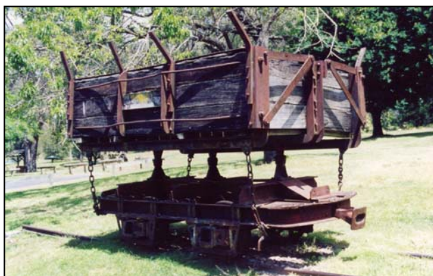
Rail tip wagon, Burrinjuck Dam