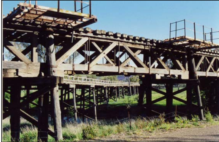
Heritage road and rail viaducts, Gundagai, NSW

It was the income from the engineered work or industry, or the provision of finance that provided for its ongoing operation and maintenance. Without that income or finance it becomes very difficult to fund conservation of the item.