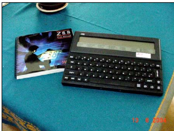
Cambridge Z88 computer, 128kb ROM, 1987

The same rules apply to the assessment of heritage significance of engineering and industrial items, as they do to buildings and other heritage items and places. However, since technology changes quickly the time factor or age of an item may have little relevance to the significance of an item.