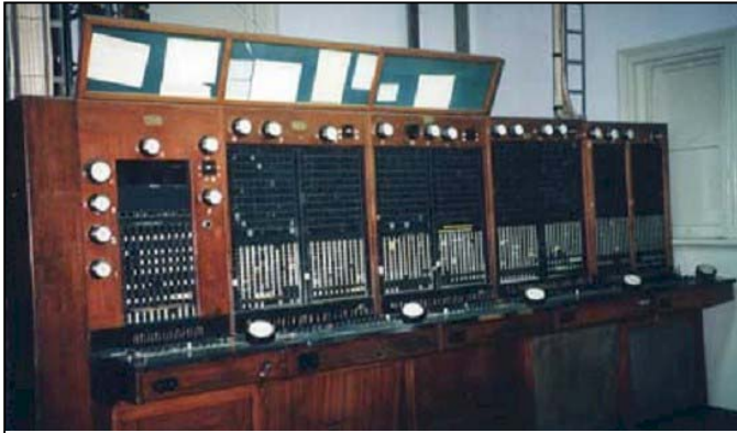
Early telephone exchange with heritage significance