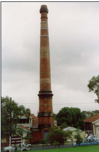
Sewer Vent, Lewisham