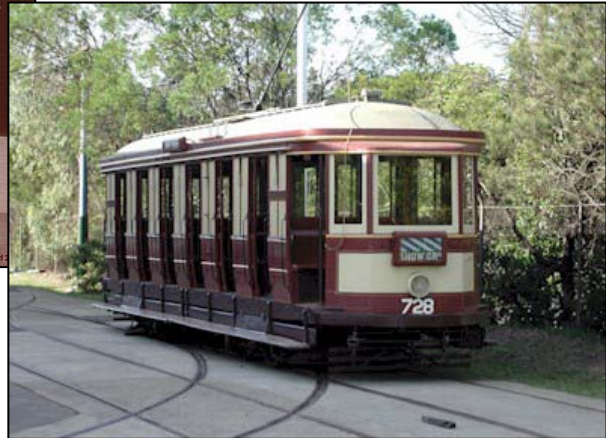
Early tram, Sydney, NSW

It is important to emphasise that the heritage professional should be on the lookout for significant technology when performing a heritage study and not only 'old' engineered and industrial works. The local hospital, telephone exchange, bank or TAFE computer facilities may have as much heritage significance as the local bridge or railway precinct.